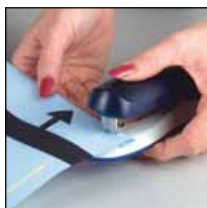
Fold & Staple