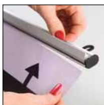
Open & Load