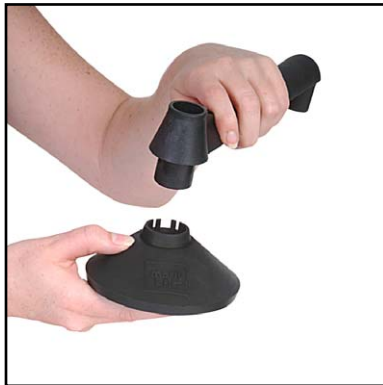
Attach bottom rail support to base, opposite the Mark Bric logo.