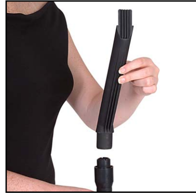
Attach top rail support.