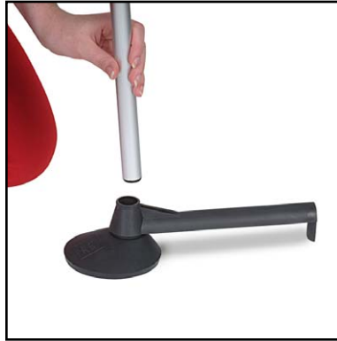
Attach pole to base.