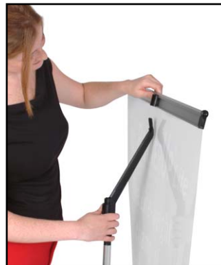
Attach top rail.