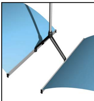
Double sided display uses 2 rail supports on bottom instead of base, as well as 2 rail supports on top.