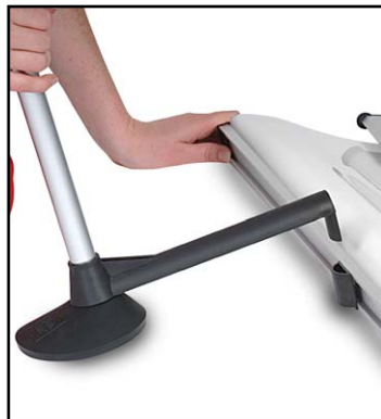
Attach bottom rail.