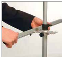
Turn the BannerRail up