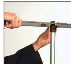
Turn the BannerRail down