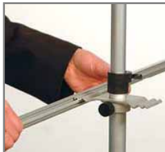
Put the multi holder in the rail