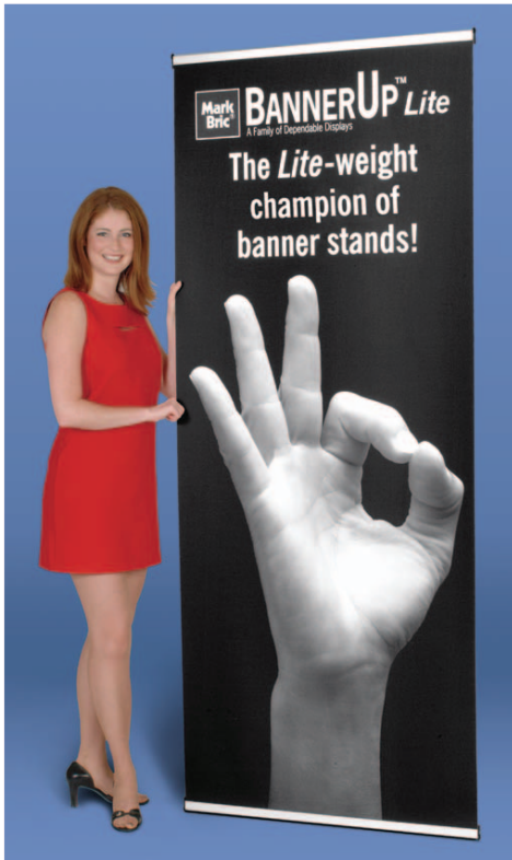
The sleek, slim lines of the Mark Bric BannerUp Lite enhance the banner.

This elegant new line of banner stands blends the best of all worlds - extremely light weight, low-cost, and user-friendly versatility. The standard 3 ft. width (34 5 / 8 "") is the same as our retractable BannerUp series. But now, thanks to this flexible new design, custom widths and double-sided capability are also available! The telescoping pole provides tension at any height between 5 and 7 ft. (5 1 / 2 to 7 1 / 2 ft. for the double-sided model). Both styles accommodate banners of practically any width. All of the stands feature a version of our popular Quick-Change banner mounting system, so you can mount your banner without the need for grommets or sewn pockets. From point-of-purchase applications to trade shows, the addition of the new Mark Bric BannerUp ® Lite assures a Mark Bric solution for all your display needs