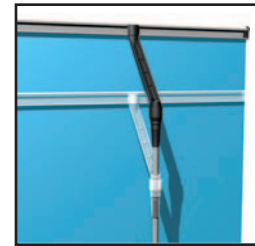
Telescoping pole allows custom banner heights.