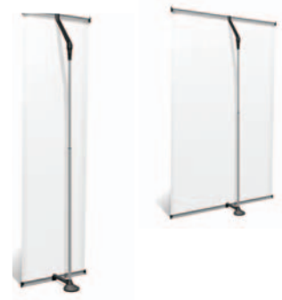
Custom widths available