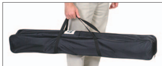
The optional nylon carry case accommodates banners up to 46" wide, with enough room for two single sided units or one double sided unit, along with a 3" diameter graphic storage tube.